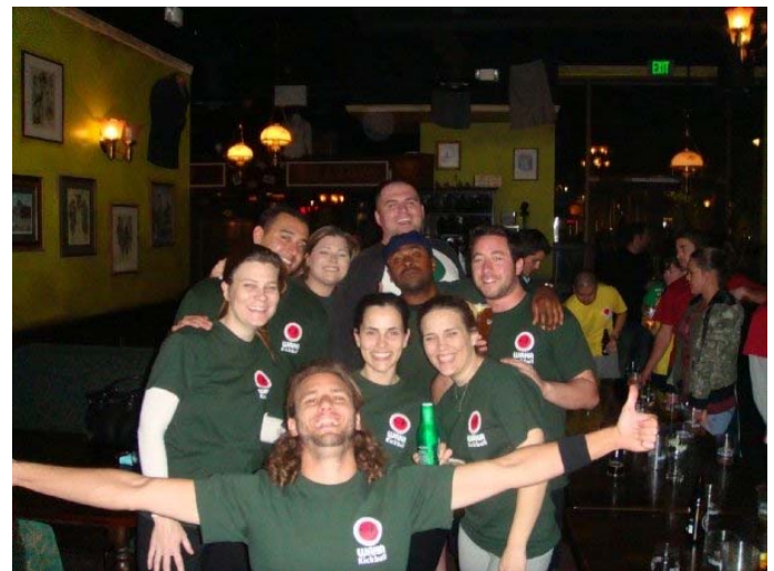
We are the Fighting EMU!