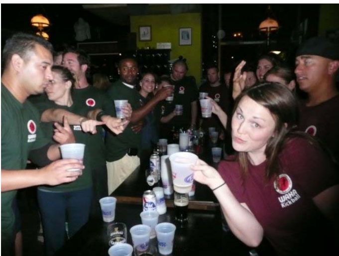
First place for one week.....