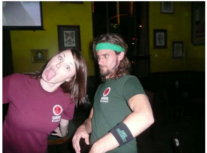
Dance Lessons Anyone?