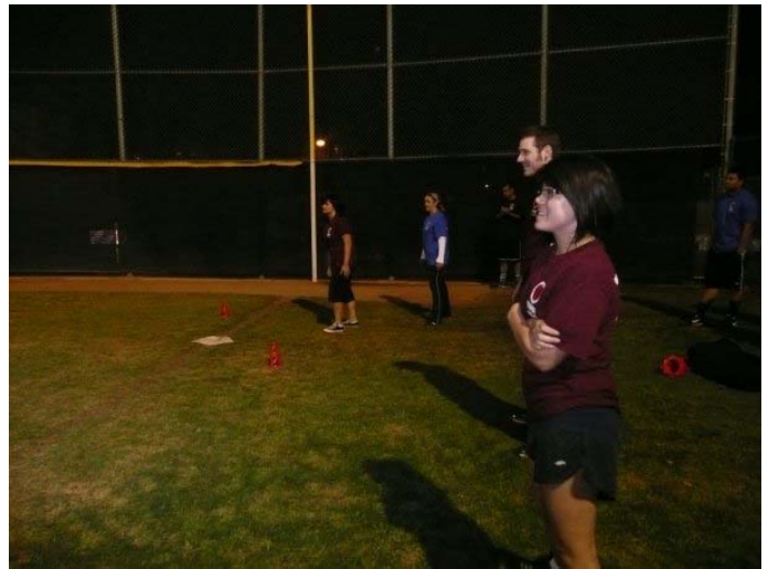
Looking To Score Vs. Ball Busters